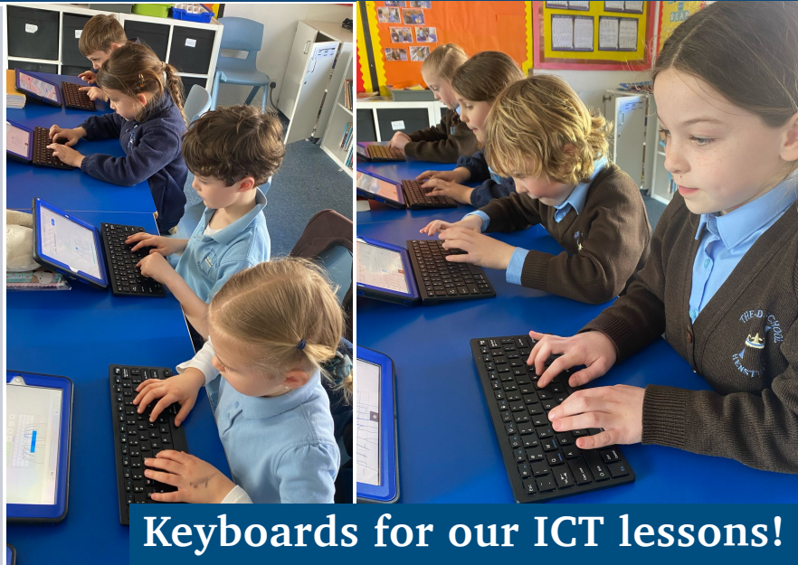
Keyboards for our ICT lessons!

The PTFA have made a kind donation to the school towards some new resources. Here are some of the items purchased so far, with more arriving soon which we will share with you. Thank you, to the PTFA and to you all for supporting the fundraising events.