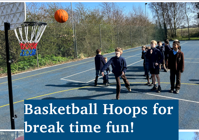
Basketball Hoops for break time fun!