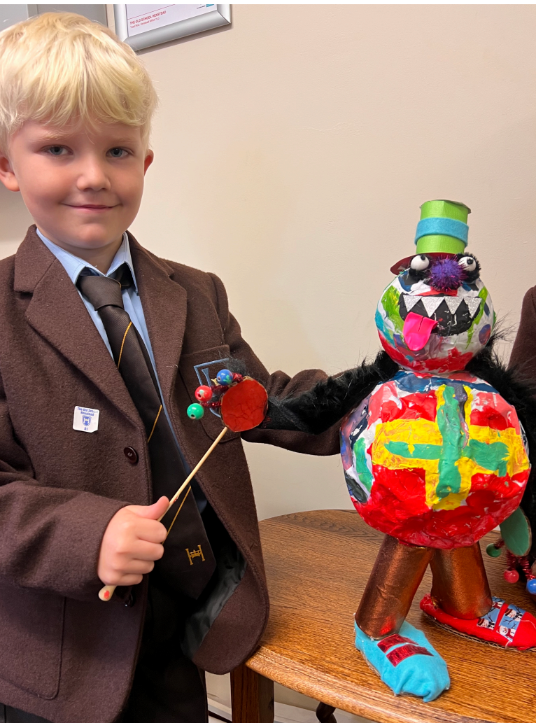
Bobbypop the Monster!