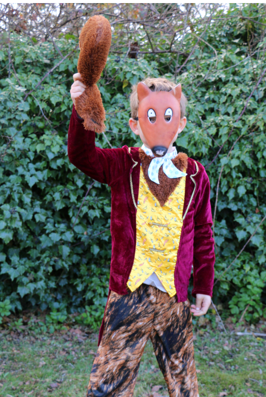
Fantastic Mr Fox