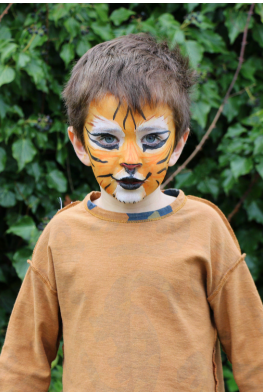
The Tiger Who Came to Tea