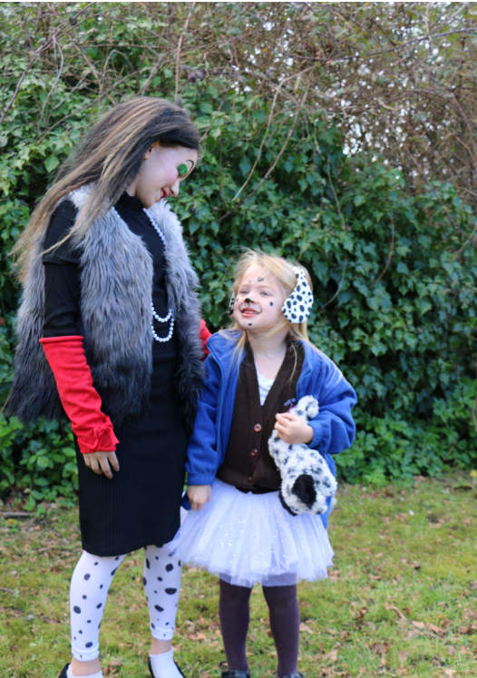
Cruella de Vil