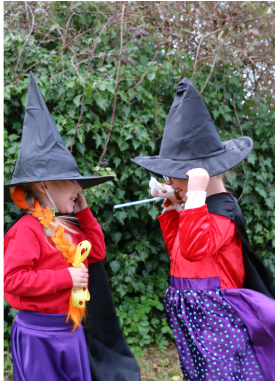
Room on the Broom