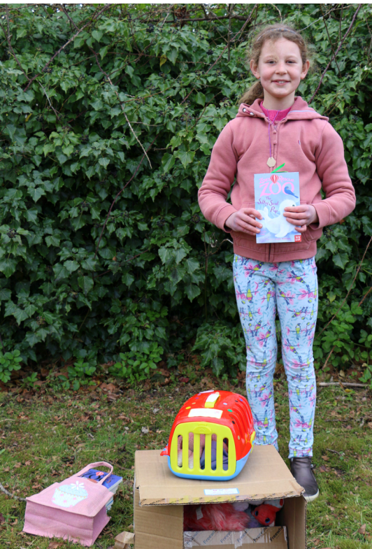
Zoe - Zoe's Rescue Zoo