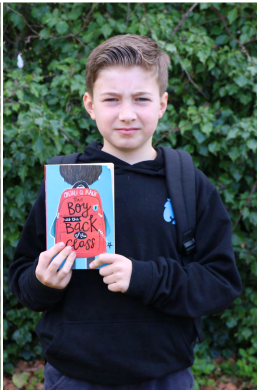
The Boy at the Back of the Class