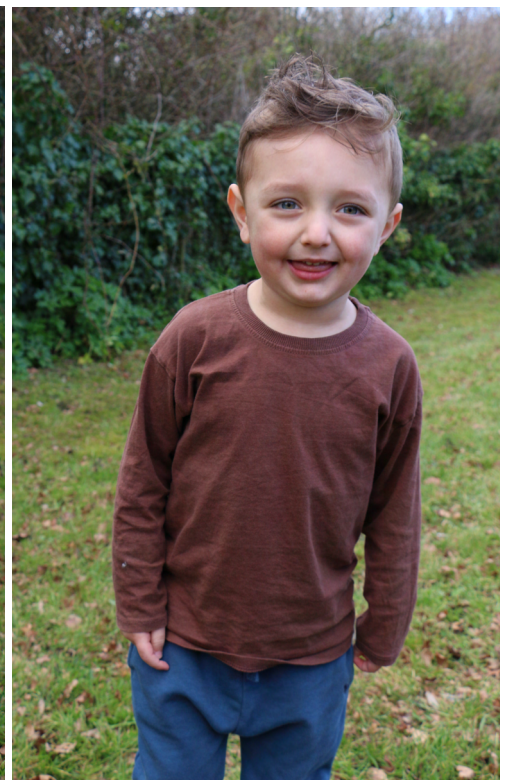
Freddie's Impossible Dream