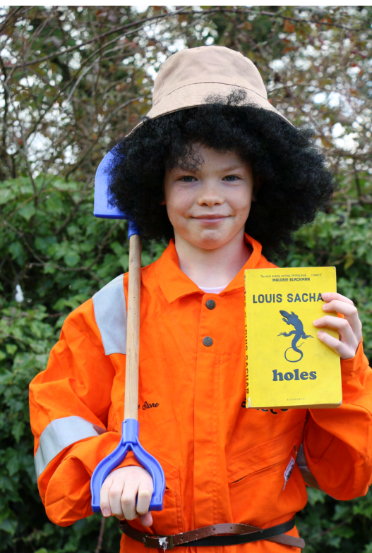
Zero - Holes