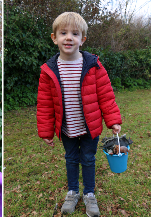
Harry and His Bucket Full of Dinosaurs