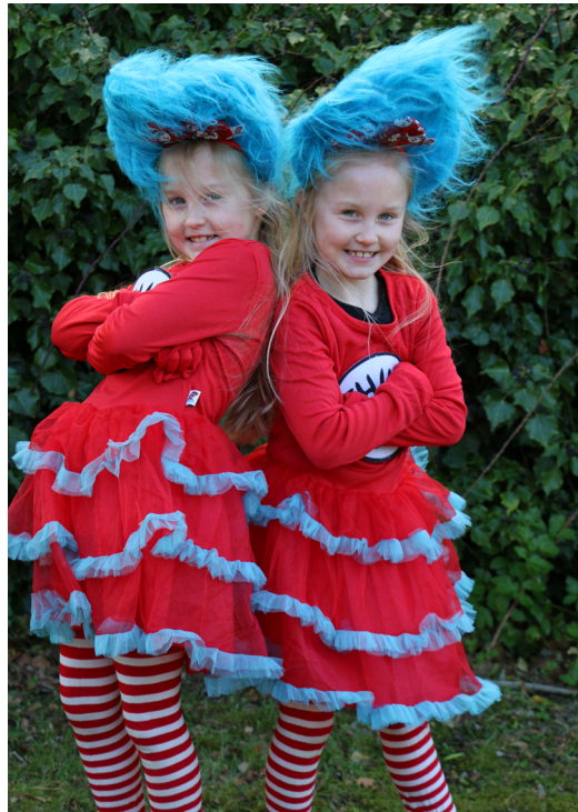
Thing 1 and Thing 2