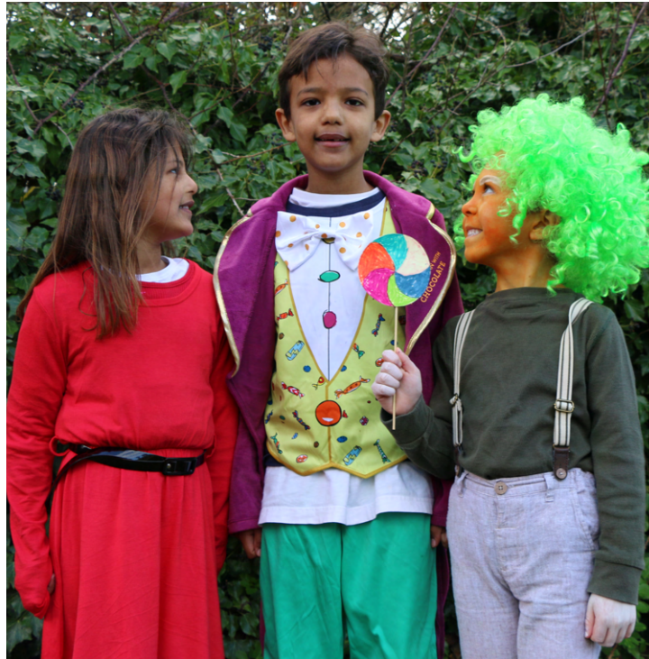
Veruca Salt, Willy Wonka and Oompa Loompa