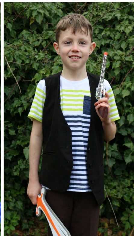
Pirate - Peter Pan