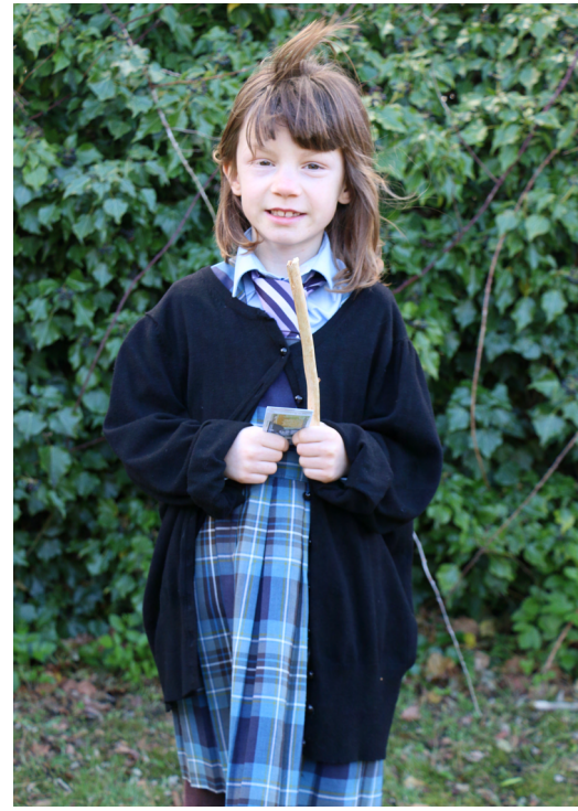
Wizard from Hogwarts