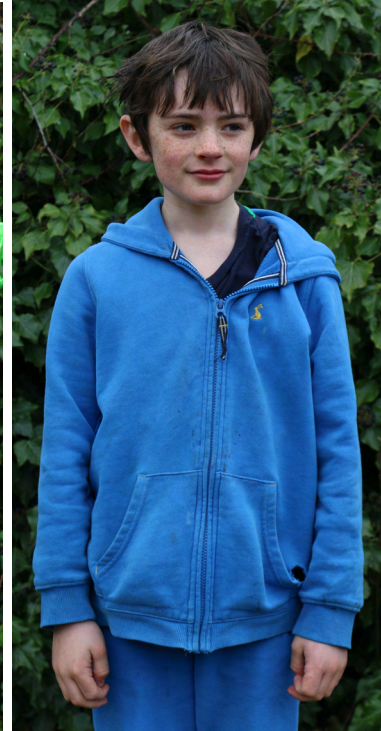
Ash - Pokemon