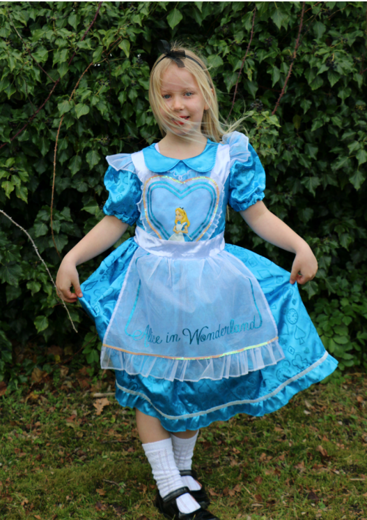
Alice in Wonderland