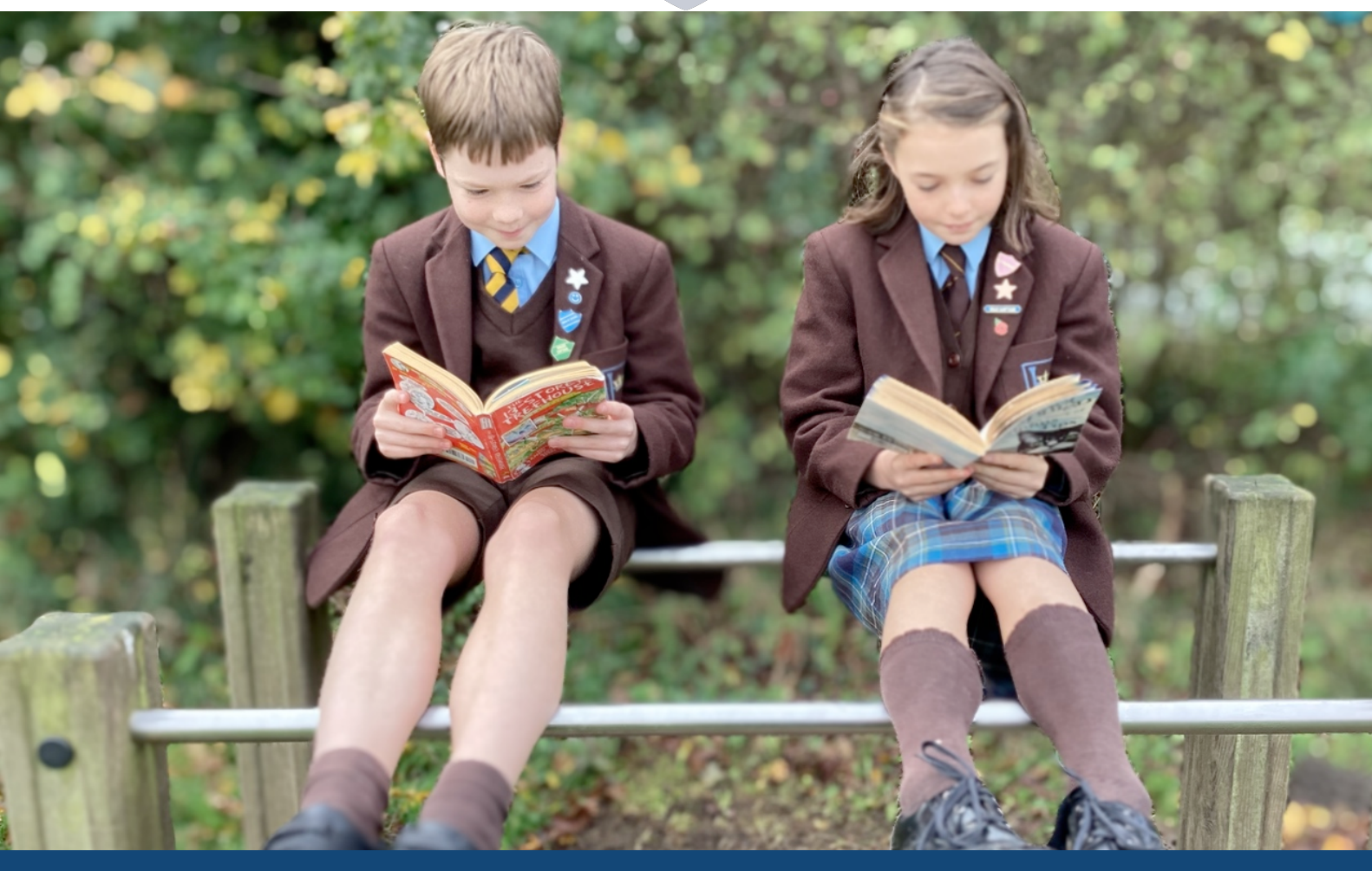
FROM THE HEADMASTER

It is appropriate, as we move on from remembrance, that our focus shifts to service. It has been a week in which our Junior and Senior choirs have sung to raise funds for Children In Need , for in serving they too are served, realising that their efforts matter, that they can make a difference, building self-esteem, resilience and confidence. Well done to all and to the many members of the school community who have supported this important annual initiative.