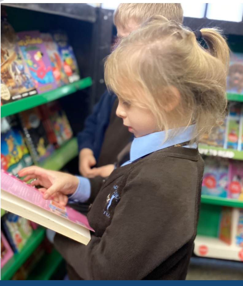
Book Fair Excitement.