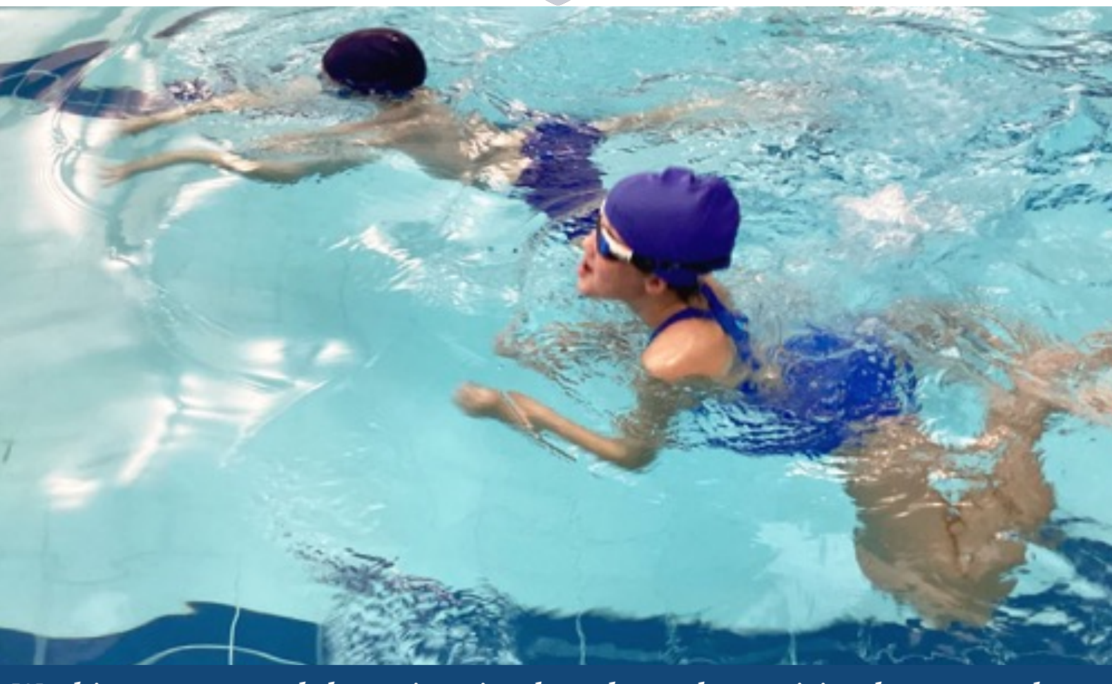
Working on strength by swimming lengths and practising breast stroke leg kicks.