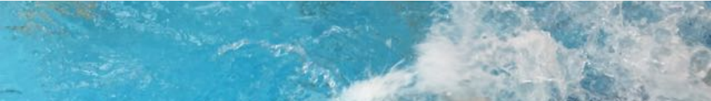
Great excitement in resuming swimming sessions for the first time in the refurbished pool.