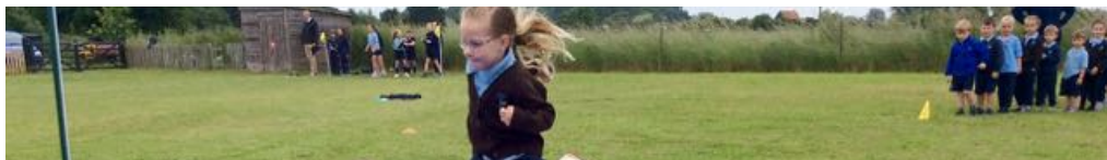
Some of our Reception pupils in their first high jump competition.