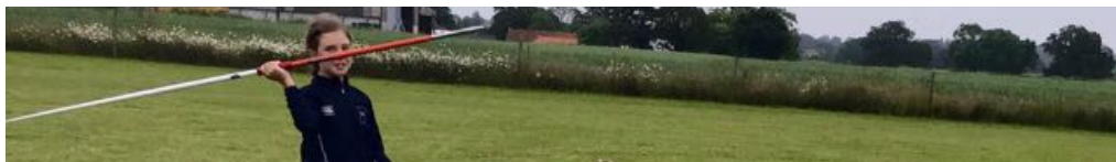
Javelin and ball throw competitions.