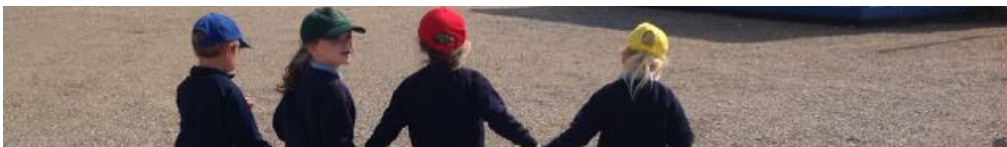
Fun on the beach and sand dunes for Reception pupils in Southwold.