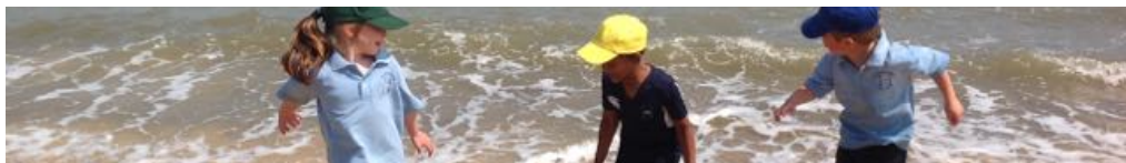
Reception pupils learn the importance of beach safety from the lifeguards on Southwold beach.