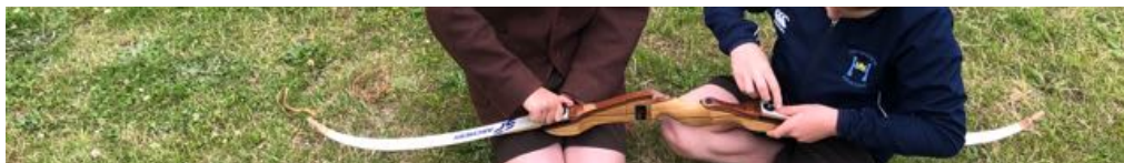
Some excellent techniques being honed in the archery after school club.