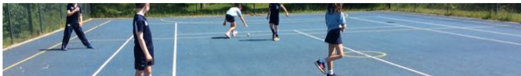
Kwik Cricket drills with Year Four pupils.