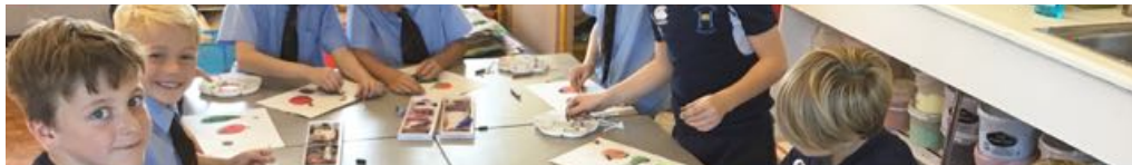
Year 4 working on their still life pieces, inspired by the artist Paul Cézanne.