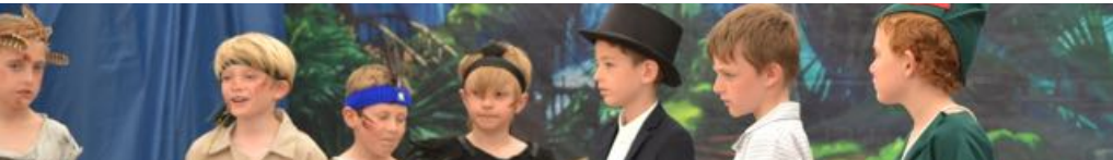
More photographs from the summer production of Peter Pan.