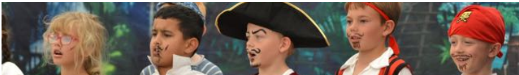
Some photographs from the summer production of Peter Pan.