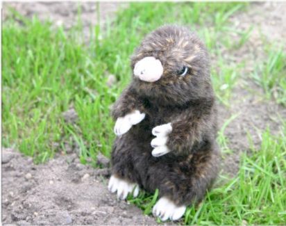
Jenny the Mole