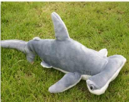
Hattie the Hammerhead Shark