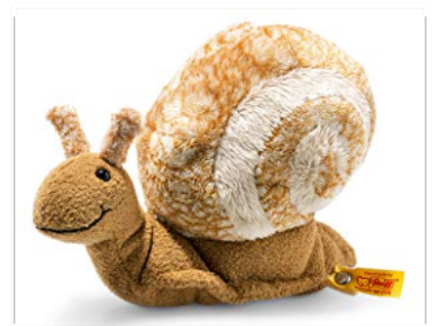
Rosie the Snail