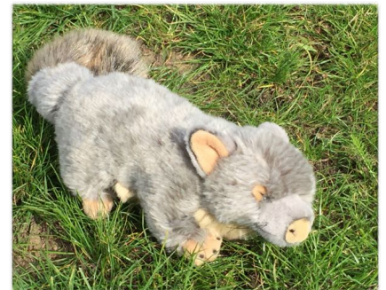
Ed the Possum