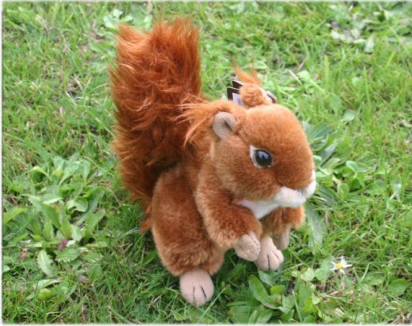
Tilly the Squirrel