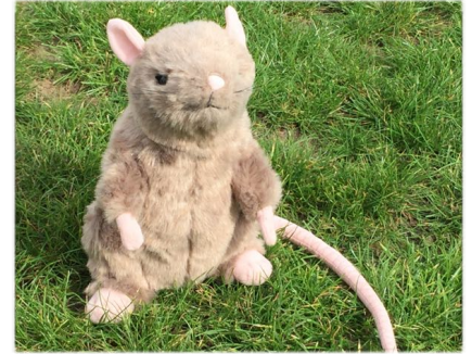
Templeton the Rat