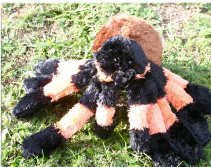
Spy the Spider

Our school's value system helps us develop us as people. We encourage pupils to focus on six values that we consider important in society today: Confidence, Resilience, Empathy, Adventure, Teamwork and Excellence (C.R.E.A.T.E.) . Each week, teachers award pupils from their classes with a mascot if they have been observed demonstrating the value of the term. Mascot diaries have documented the mascots' adventures over the week. This academic year we want to encourage pupils to extend their creativity through writing mascot entries that are based on fictional events (for example the mascot visiting space for the weekend and going for a walk on the moon).