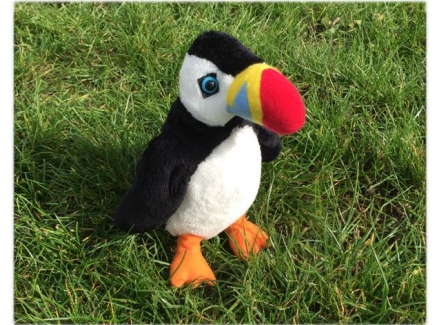
Muffin the Puffin