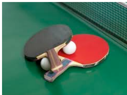
Table Tennis Gift