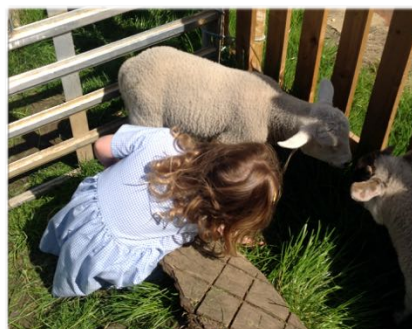
Nursery children enjoyed learning about lambs during their recent stay at school.