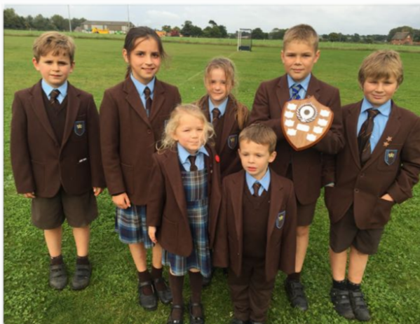
House Quiz Winning Team