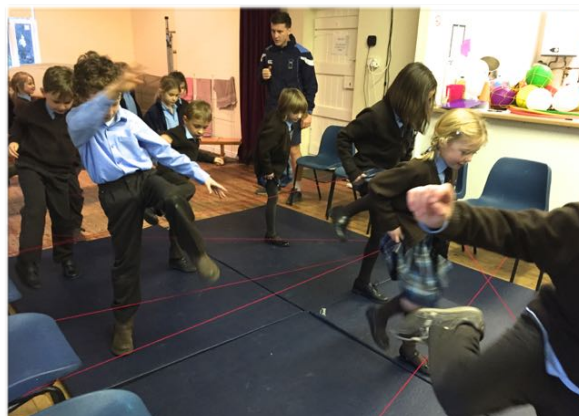
Spy School pupils get active learning some James Bond skills!