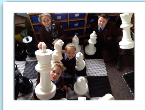
School Council Members unwrap the giant chess set purchased using funds raised through the recent Mathematical fundraiser.