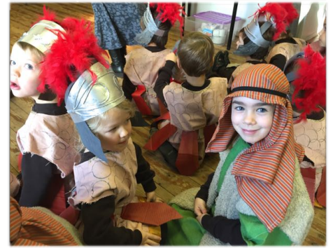
A glimpse behind the scenes as the Junior School rehearses for next week's Nativity Play.