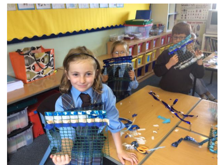
Year 2 pupils create woven seascapes in Art.

PTFA AGM & Meeting Monday 28 September 7.30pm